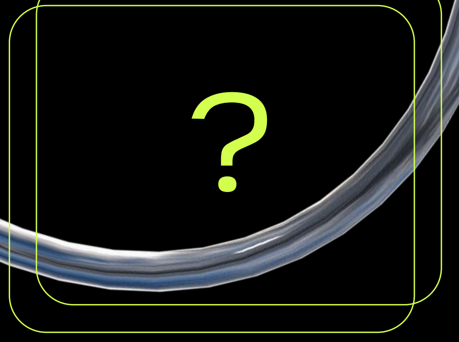
Our next hero